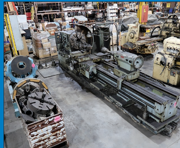
36" x 126" Poreba TAK-90A1-E2 Heavy Duty Engine Lathe