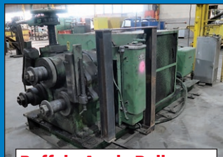
Buffalo Angle Roll