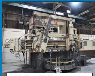
84" Gray VTL

For Detailed Specifications, Photos, Link To Online Bidding And Terms Of Sale.